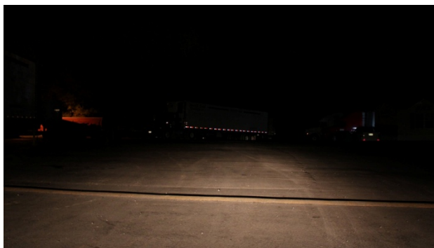
Trailer at 45^{\circ}

The photos below show the difference between a truck trailer angled at 45^{\circ} (left) and 20^{\circ} (right). In these photos, the angle of observation, or vertical angle with respect to the ground, is about 4^{\circ} —a small SUV—and the headlights are set on low-beam at approximately 200 feet. Although the images are small, it is obvious that the reflective tape is visible in the 45^{\circ} photo and that the tape is much less visible in the 20^{\circ} photo.