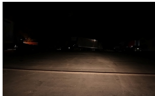
Trailer at 20^{\circ}

You can view a video of this tractor and trailer pulling out here.